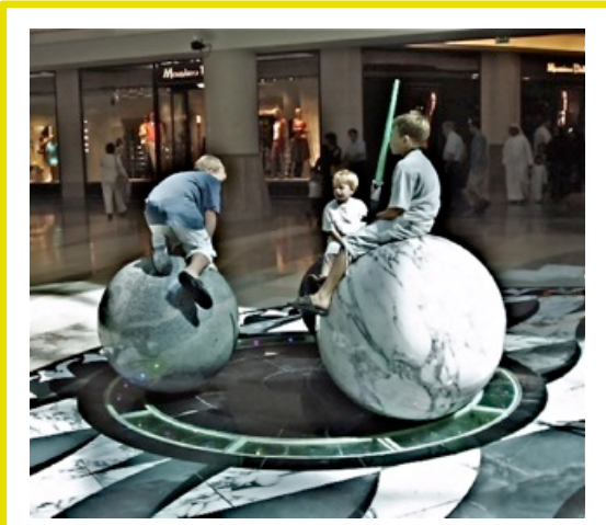
The designers of this mall forgot to consider what this feature would "afford" children to do with it.

environment interactive that were not intended to interactive. There are vast differences in the way children and adults interpret their environment. Adults view the environment in terms of form, shapes, and structure and as background. If a sofa is in a public place, adults will interpret it only for its socially acceptable use, for sitting upon. Children, on the other hand, interpret the environment holistically and evaluate it for all the ways they can interact with it. They are biologically programmed to use the environment to aid their development by exploring ways they can use it for activity. They look for the