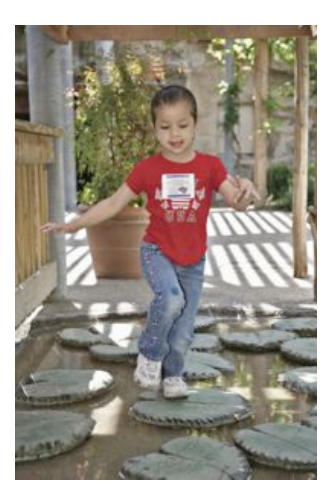
Kronkosky's Tiny Tot Nature Spot at the San Antonio Zoo